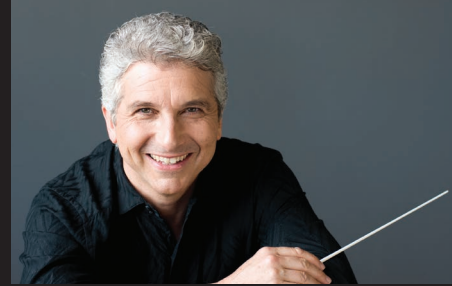
Peter Oundjian Guest Conductor